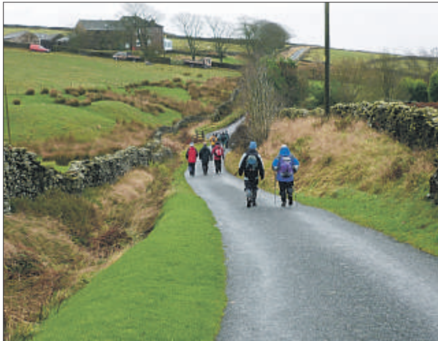
ON THE WAY: Walking along Gisburn Old Road

Summit to car park. Begin a gentle descent bearing left so you regain the wall and follow this down to where it meets a lane end (Gisburn Old Road). Still on the Pendle Way turn left and walk past Weets House. Keep on the lane for the next 1500/ mile. Just beyond Star Hall you will part company with the Pendle Way which bears off to the right. After Star Hall take the first footpath on the left. This crosses three fields to reach Lister Well Road, which is not a road at all, but a rough track. On reaching it turn left to commence a long straight descent back to the B625 on a gradually improving surface. At the road turn left for the car park which on a clear day you would have spotted from some considerable distance away. [If refreshment is needed on route a detour to the Moorcock Inn can be easily