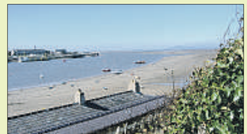
The Wyre estuary from Knott End

For full details of all our walks and activities please call 01995 602125, email countryside@wyrebc.gov.uk or hit www.wyrebc.gov.uk/find/activewyre