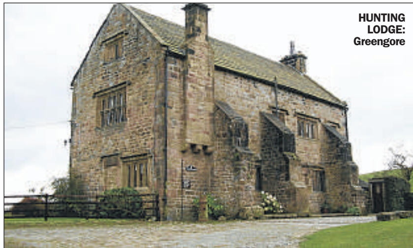
HUNTING LODGE: Greengore

Directions: The walk starts along the road towards Clitheroe for some 700m. Then turn left along the drive leading up to Fair Field. Here, in late October 1905, Ikutaro Sugi died after a long and painful illness. Follow the track to the right of the house and then through a gate into the grounds of Stonyhurst College. Across the cricket field there is a handsome